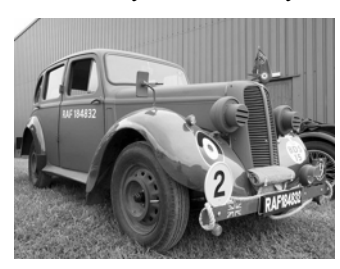
1938 Hillman Minx